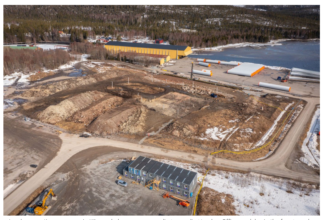
Land preparation measures in Köpmanholmen are proceeding according to plan. Office modules in the foreground are utilized by Cinis Fertilizer's construction contractor. In the background, outside Cinis Fertilizer's property, parts of a wind turbine have been delivered for further transport.